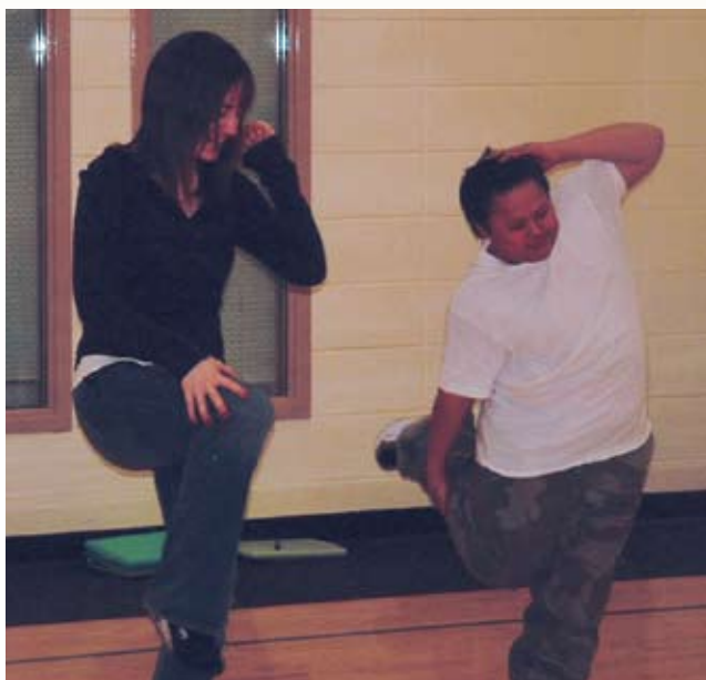
Waiver staff and clients perform their rendition of a touchdown dance during the OU Superbowl party.

The Waiver department hosted an early Superbowl party on Friday, January 30th, to gear up for the big game on Sunday. Clients and staff alike enjoyed the party snacks, music, games, and contests. Clients could participate in games including a football walk (similar to a "cakewalk"), football toss, and football bowling. Clients and staff were able to demonstrate their creativity and dance moves with the "Touchdown Dance" contest. It was great to see everyone supporting each other while they participated in the various games and contests! ♥