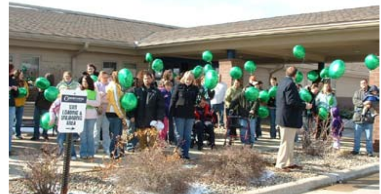
Individuals gathered at Opportunities Unlimited on March 11, 2009 to commemorate Brain Injury Awareness Month.