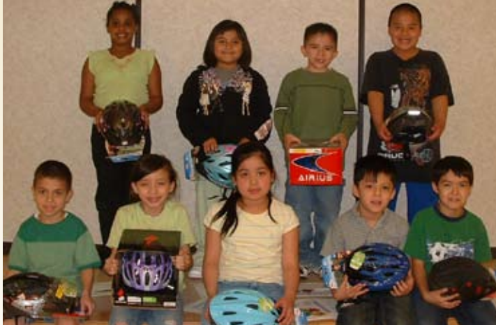
Essay winners from Irving Elementary pose with their new bicycle helmets.

In addition to celebrating Brain Injury Awareness Month with a reception held at Opportunities Unlimited, the organization also went out into the community to promote increased awareness and prevention. For the third year in a row Opportunities Unlimited has partnered with the second grade classrooms at Irving Elementary. This year was the first time that OU has taken on a second school, Leeds Elementary. Students were challenged to write an essay on bicycle safety and many of the students chose to illustrate their work. Some of the children suggested wearing elbow and knee pads, some talked about using hand signals and cross walks, others talked about the importance of riding bikes with an adult. Each essay was judged and two students (a boy and a girl) from each classroom were selected as the winners. Between the two schools there were 10 classrooms and over 190 students involved.