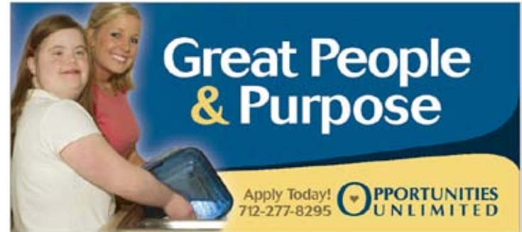
Opportunities Unlimited has used billboards to recruit new staff and Annual Angels

The goal of these changes has been to have our public image portray our internal commitment to excellence. The culmination of this project is currently underway.