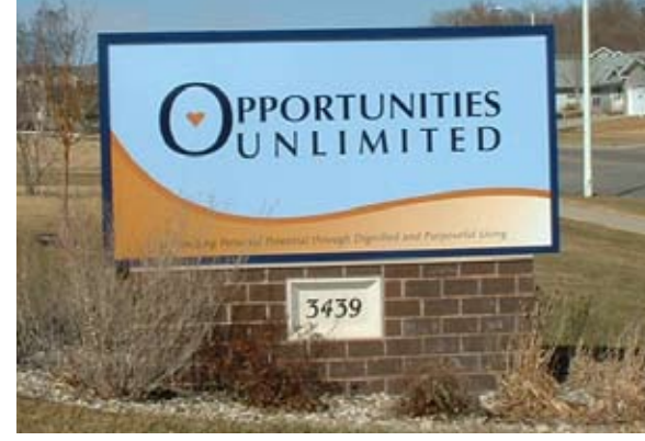
New sign welcomes visitors to the Opportunities Unlimited Center.

Opportunities Unlimited is in the process of updating its website found at www.opportunitiesunlimited.com . In the upcoming months you can look forward to a new website that is informative, mission driven, and current.