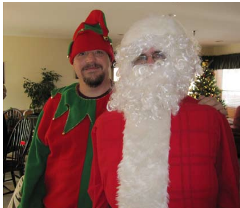
Santa and his helper visit OU for our Christmas Party.

The holidays at Opportunities Unlimited are always a delightful time of year. There are special meals to prepare to share with our OU family, treats to make, songs to sing, prayers to pray, joy, parties to have and presents to wrap. You could say that at OU, we are truly blessed. In our community, however, there are some not so fortunate.